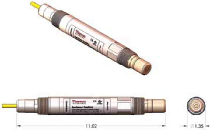
ppb Trace DO DataStick Dimensions