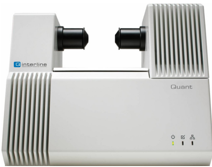
Figure 1: The AgriQuant FT-NIR

interferometer technology the AgriQuant requires preventative maintenance at only 5 year intervals (source replacement), has a small footprint, no hygroscopic optics, incorporates a modular design allowing rapid detector changes and allows the development of unique sample handling accessories.