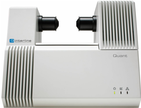
Figure 1: The Quant FT-NIR analyser

The Quant FT-NIR analyser system is a revolution in FT-NIR technology and user friendliness. Designed around new FT-NIR interferometer technology the Quant requires preventative maintenance at only 5 year intervals, has a small footprint, has no hygroscopic optics, incorporates a modular design allowing rapid detector changes and allows the development of unique sample handling accessories.